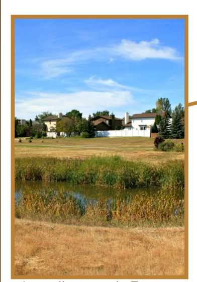
Lots adjacent to the Tatagwa Parkway and close to future green space