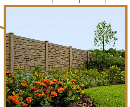
Premium Sim-Tec PVC fencing between rear yards